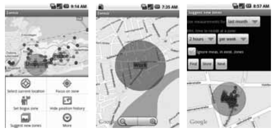
Figure 2: Definition of zones

The model is easy to understand by the mobile user and allows the execution of efficient algorithms. To define a new zone, a user points on a map and specifies name and radius. For the radius, there exist discrete values 50m, 100m, 200m,..., 50km. It is important to note that the map is only required during zone configuration.