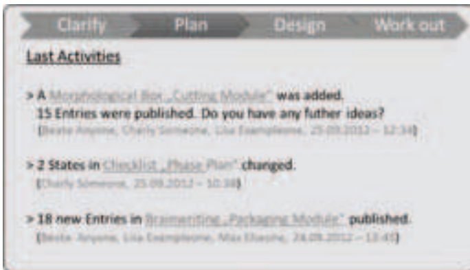
Figure 1: Exemplary project Activity stream

Furthermore the user can access each project by the links of the activity stream or he can create a new project, provided he has the necessary rights.