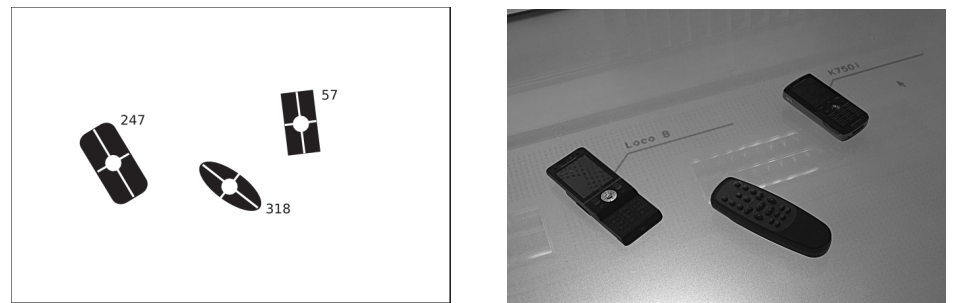
(a) Data provided by the shadow tracker: tracking ID, location of centroid, size of shadow area and major/minor principal axis. Roundness is implied by size/axis ratio. (b) Two mobile phones are automatically annotated with their Bluetooth names. One non-Bluetooth object on the table surface is ignored.

The second criterion which we examine is blob motion. Before a phone can be reliably recognized, it should remain motionless on the table for one second, as this is approximately the duration of one inquiry scan cycle. Our software examines the blob position for the last 30 frames and calculates its standard deviation. If it falls below a threshold of 2 pixels, the blob is considered a candidate for being from a mobile phone.