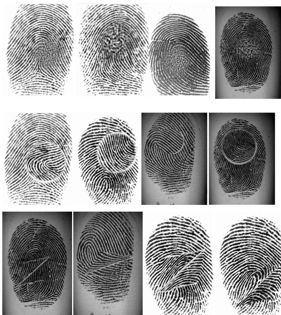
Fig. 2: Examples of simulated alterations: obliteration (top), central rotation (middle) and z-cut (bottom)