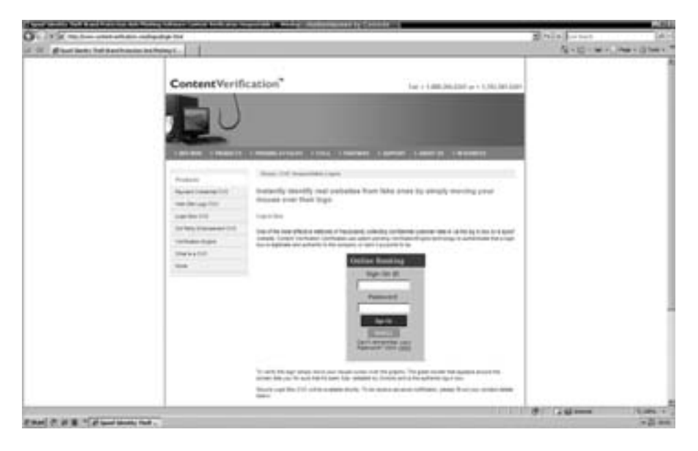
Figure 4: Visual of approach III: Border when mouse is over login form [Com10b]

when data is entered into the detached browser window instead of the iframes or not. However, this approach is appealing for several reasons: First, it is generic and works with each and every page that uses TLS-secured content in an iframe. Second, it works without depending on additional signatures. Third, it allows the user to clearly separate which content came from which site, thus offering hop-to-hop authenticity and up- and downstream confidentiality. Thus, approach IV solves the problem. Last but not least, it is secure as long as Firefox's TLS verification works securely, which is assumed. The drawback: It radically breaks the unity that probably was the reason for embedding the contents in the first place.