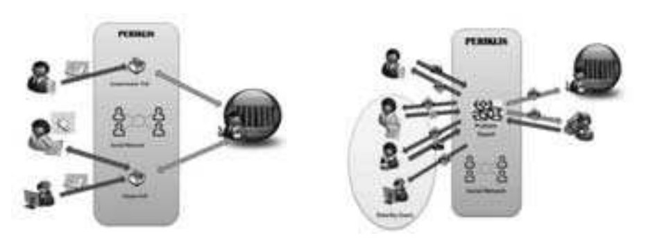
Figure 2: Use Cases: i) Citizens and politics, ii) Citizens in action.

The results can be analyzed on the basis of common agreements and substantial disagreements, allowing for additional plugging in of statistical analysis filters, visualization tools etc. allowing the query issuer to basically interactively see the results of the poll. As the system allows for full participation of all members, the query issuer can directly intervene in the discussion, and / or adjust the poll if the results indicate that specific actions / directions need to be pursued further.