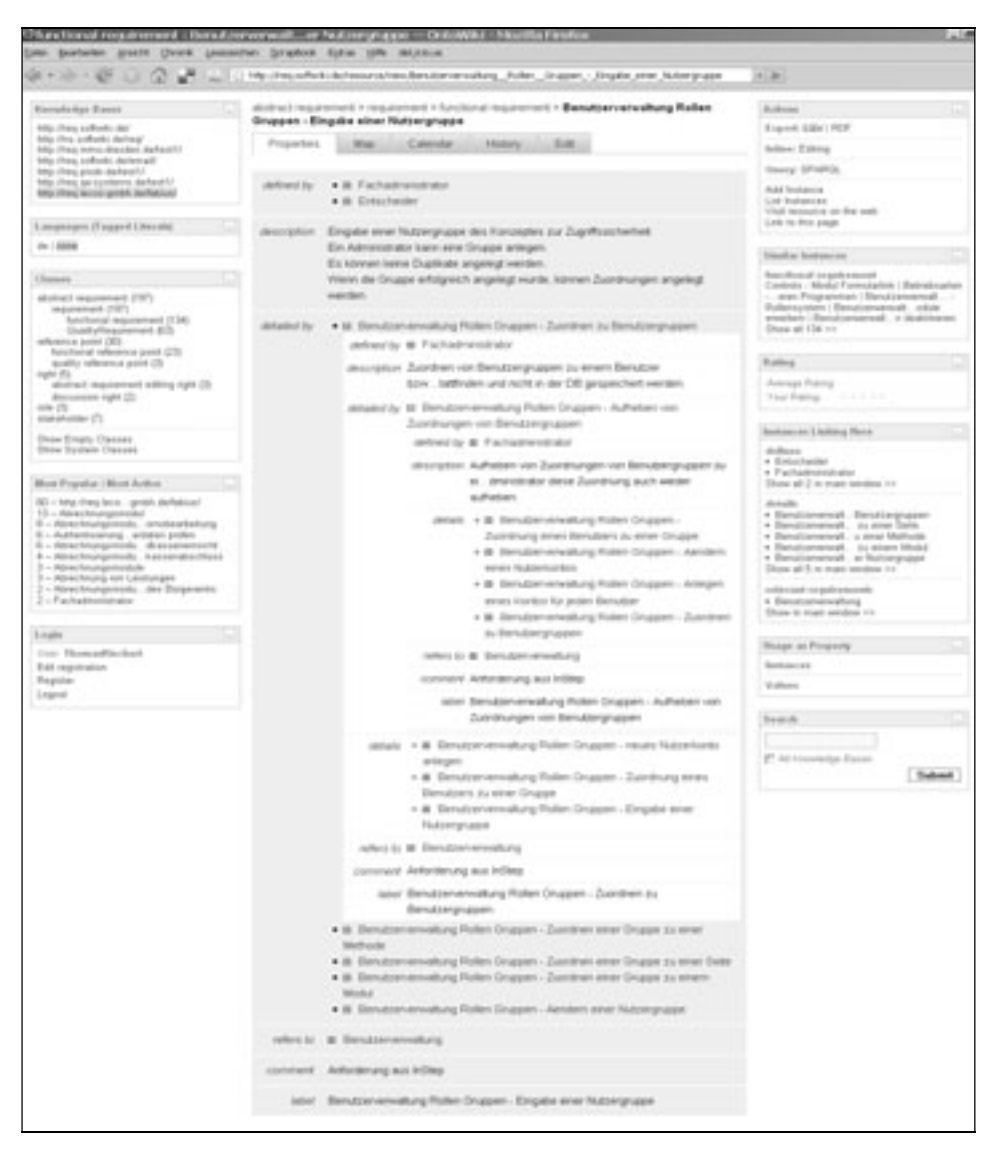
Figure 3: A knowledge base for requirements of an e-government use case managed in the OntoWiki tool

attributes as well as inline editing possibilities. In the screenshot, a functional requirement instance related to user roles and access control concerning the e-government application is presented. Additionally, its attributes description , comment and label as well as its relations defined by , detailed by and refers to are displayed. Instances that are related to the selected one are shown in more detail by clicking on the plus icons. Other views can be selected via tabbed navigation, such as a map, a calendar, or a view on the change history. The right area provides additional, context-sensitive features including search, similar instances, and rating options.