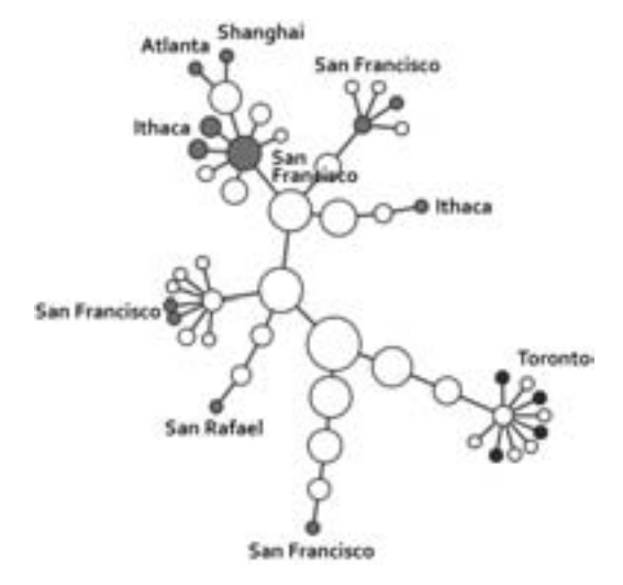
Figure 1: Project team structure visualization generated from email list, showing both physical distribution and hierachical organization.

The basic data for each employee (Name, Location, Title, and Manager) was accessed from a spreadsheet from the Human Resources (HR) department intranet. That data was then loaded and analyzed to count the number of direct and total reports for each manager. TeamViz was highly interactive. Clicking on a manager node would open it up to display all of the manager's direct reports. Middle clicking on a node would open up the employee's HR webpage. Hovering over a node would display a tooltip including the employee's HR photo dynamically downloaded from the company website. Finally, dragging an email onto the window would add all recipients of the email to the graph. Using the email list for the sixteen people on the team resulted in the visualization shown in Figure 1. The layout is achieved through an energy minimization algorithm treating the edges as springs holding the nodes together, and having each of the nodes repel from every other node.