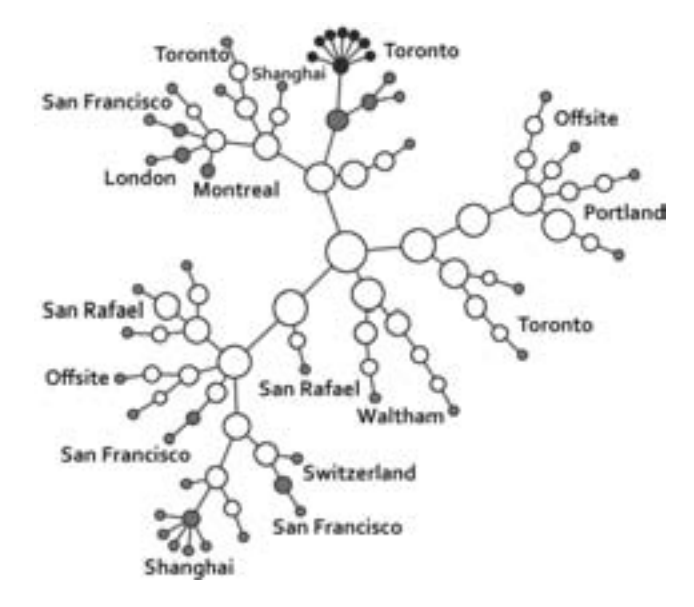
Figure 2: Larger cross-divisional team of 49 people, shown as shaded nodes, with 94 employees shown in total, leaving 45 managers to connect all team members.

Despite any naturalization problems encountered in the first component integration project, the result was considered by management to be a success. This lead to the decision to integrate the component into at least four more products and, from the perspective of the team, began a new naturalization process with a completely new set of people. The new larger team was explicitly cross-divisional and contained 49 people, with 45 managers appearing in the tree connecting the team members, as shown in Figure 2.