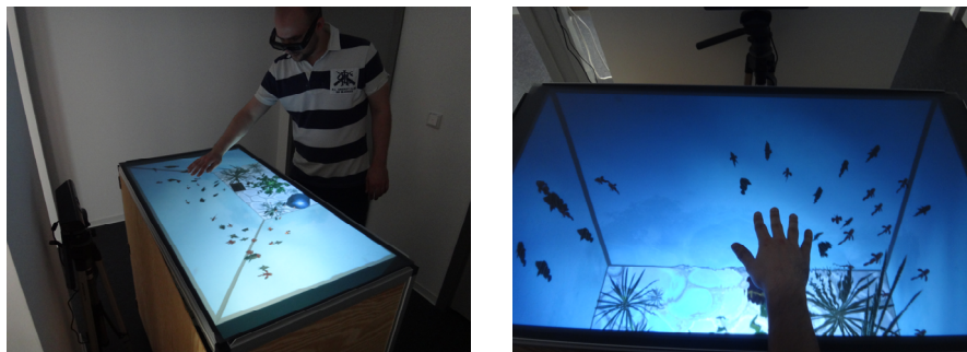
Figure 2: Responsive Fish Tank application: Overview (left) and user's perspective (right)

The simulation of a fish tank is a common theme in virtual environments (Mulder & Van Liere 2000, Ware et al. 1993). The responsive virtual fish tank demonstrated is reacting to user presence in multiple ways. The Kinect sensor tracks the user's head-position in order to render the stereoscopic three-dimensional scene. Touches are registered via the IR camera: When a contact with the display is established, a rippling effect is simulated and nearby fishes try to avoid the intruder (see Figure 2). Due to the sensors' oblique modes of operation, the user can freely interact with the application.