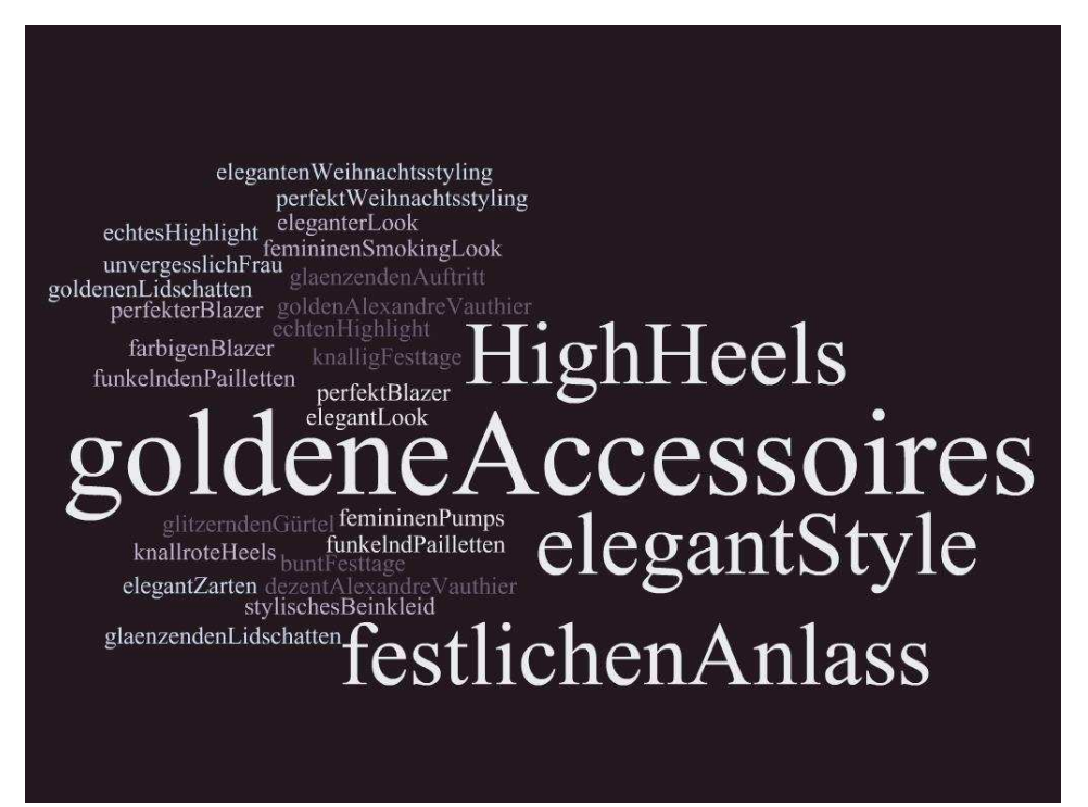
Fig.4.1 Extracted word combinations

way. Figure 4.1 illustrates matched word combinations in the area of evening robe, glitter and sparkling clothing. The font size of the word combinations correspondents to their frequency rates: the larger the font size, the higher is their occurrences within the text. In the most cases, the tool matched adjective-noun combinations. However, in the example of femininenSmokingLook , we can see that in a first step the two nouns Smoking and Look are combined, and in the second step the adjective feminine is matched to the new combination.