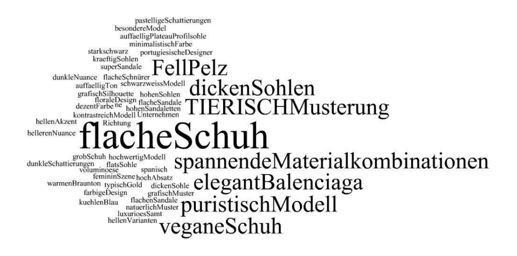
Fig.: 4.3: Extracted word combinations on shoe features