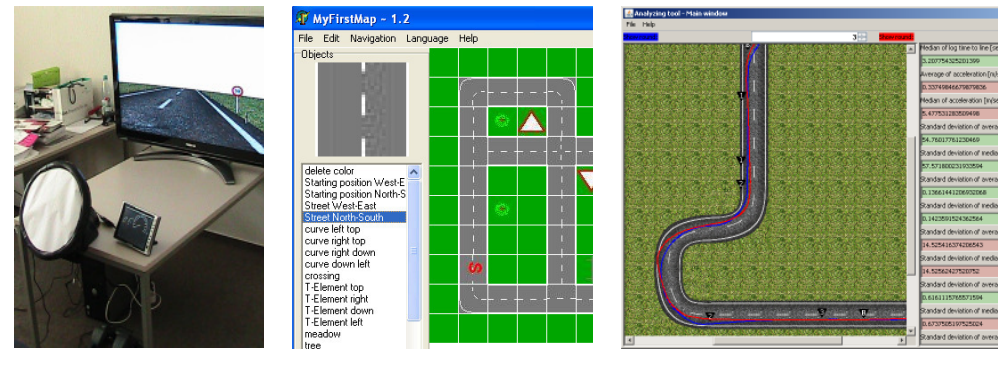
Fig. 1: Simulator setup.

CARS is an open source, low-cost, PC-based driving simulator. The system requires a consumer PC, a game steering wheel, a brake-and-gas-pedal gaming device, at least one display (monitor or projector), see Figure 1. The setup shows a 47" display which renders the road and environment, steering wheel and pedals and an additional, 8" display (secondary display) for the speedometer. The simulator shows a road with roadside markers and grassland in 3D. The driver controls the car by using the steering wheel and the pedals. CARS is designed to support the early stages of a development process for in-car systems by providing a concrete basis for making design decisions. So far CARS does not provide an absolute and proven measure of real driver distraction. Further tests and comparisons with a high-fidelity driving simulators or field tests will be needed to provide calibration for real driver distraction. CARS consists of three main components: a map editor for creating the route according to specific requirements with different street elements, speed limit signs, etc., the driving simulation tool and an analysis tool for calculating driver's performance.