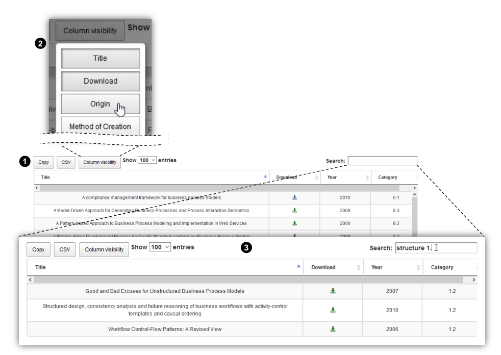
Fig. 2: Search Page of the Repository, Columns and (Semantic) Search

values are displayed in a column of the table or not. Moreover, 800 keywords have been added to the table. In this way, the user can retrieve pattern works even if she or he is using a different terminology than the authors of the pattern works. For example, if the user types in "structure 1." (cf. Fig. 2, 3), then the result table is reduced to three result rows accordingly. Whereas for two of these entries, the word "structure" is contained in the paper title, the third entry does not contain this word in the paper title. This abstraction from the syntactic level thus implements a semantic search feature ( R4 ).