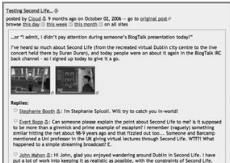
Figure 2: An example post and aggregated replies

After selecting a particular forum, the user is presented with a list of posts in this forum in a reverse chronological order. As usual in feed readers, each post is summarised and can be opened to read the full content. An example of detailed view is shown in Figure 2, which includes metadata about the post, its complete text and all replies (which might have been posted outside of this particular weblog). Also, “lateral” social browsing is supported: clicking on an author or commenter jumps to this person’s profile which includes all posts and replies written by this person across all forums; clicking on a topic shows all posts tagged with this topic, again across all forums. In contrast to ordinary feed readers, our lateral browsing works across all types of community forums: clicking on the user “Cloud” will not only show all his weblog posts, but also his contributions to mailing lists, IRC discussions, bulletin boards, etc.