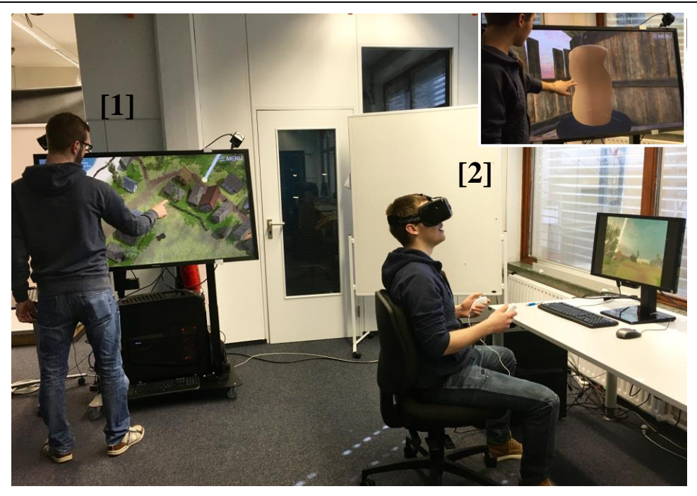
Figure 1: Illustration of the setup of the multi-user interactive exhibition. Player [1] is using the multi-touch table and player [2] is wearing a head-mounted display. Both players are present in the physical setup while experiencing the same shared virtual space from different viewpoints. (Note that the distance and angle of users is just for photographic reasons. Usually users cannot see the screen of the other player). The inset shows a user performing the virtual pottery task using touch input to form virtual clay.