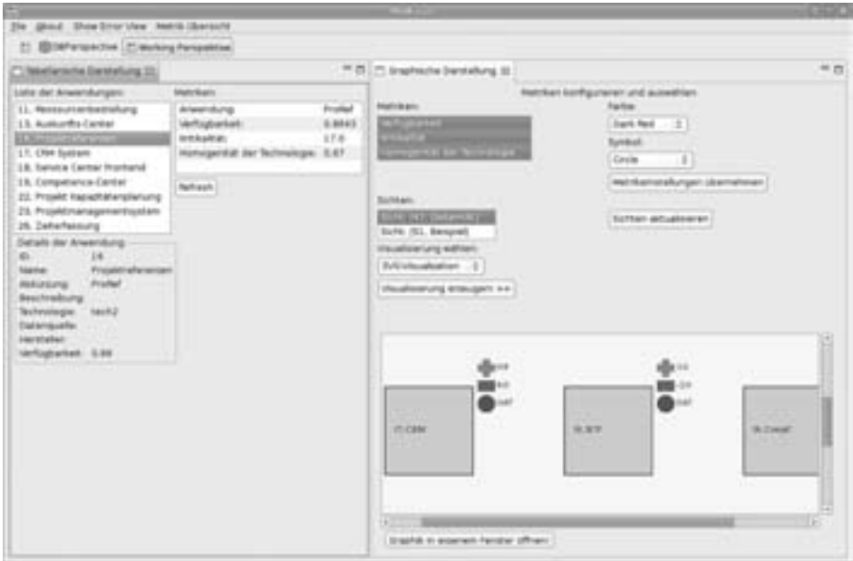
Figure 3: Screenshot of our metrics tool-prototype

This visualization is intended to support CIOs at architectural decisions by presenting the quality of applications regarding the selected metrics. Since metrics are defined as plugins, these can easily be added or removed, without modification of the tool itself. All included metrics are listed in the metrics overview window. Beside the metrics' names, the list also contains the complexity classifications (cf. section 3), the key figure objectives (cf. Figure 2), and the classification of the key figure with regard to the taxonomy described in section 3. All this information must be specified in a proprietary XML-file as part of the plugins. In future versions of the software this list is intended to also present the percentage of required data so that the CIO can decide not to use a metric, if the required data is unavailable.