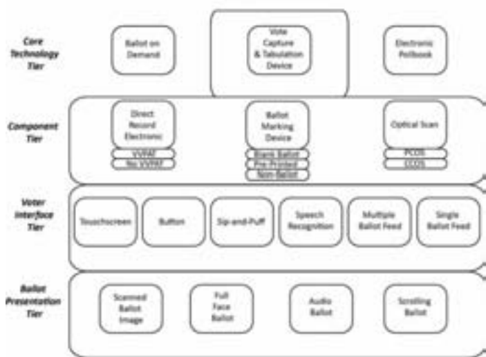
Fig. 2: Electronic Voting Classification Structure

The Electronic Voting Classification Structure (EVCS) is composed of four tiers: core technology, component, voter interface, and ballot presentation. Figure 2 presents the classification structure developed to assist in the identification and classification of electronic voting systems.