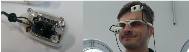
Figure 1: Prototype of a 3D printed open source gaze tracker

The eye trackers a) and b) are running with 30 fps at a resolution of 1280x720 pixels. An array of 4 infrared LEDs in a) and 3 in b) illuminate the eye to determine the center of the pupil and corneal reflections. The LEDs are connected to the camera board and powered by USB. The camera and the LEDs are housed in a 3D printed shell. This is attached to a 3D printed spectacle frame with a 5 mm aluminum bar. Frame and camera shells were printed with a Dimension 1200 3D printer within 8.5 hours. A 5x7 mm sized, unified lightened photo negative was placed between the CCD and the lens to filter colored light.