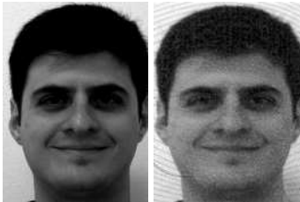
Figure 1: FEI, Original and Scan

We took two image sets of front images from the FEI Face Database 3 and the Color FERET database [PWHR98, PMRR00]. Both image sets do not satisfy requirements set by ICAO for biometric face images – but in practice, these requirements are often not adhered to anyway. Thus from the FEI Face Database the subset frontal images, manually aligned, was used, and from FERET subset fa and subset fb those frontal images were selected that meet best the above mentioned requirements, especially w.r.t. lightning. Image contrast was then enhanced using IrfanView’s 4 auto-enhancement, the images were printed on genuine Schengen-visa stickers using an off-the-shelf inkjet printer, and then re-scanned at 600dpi using a Kyocera TASKalfa 420i office scanner. After sorting out misprints, we were left with 368 images from FEI from 184 persons (one smiling, one with a neutral expression), and 768 images from FERET from 768 persons (one image per person).