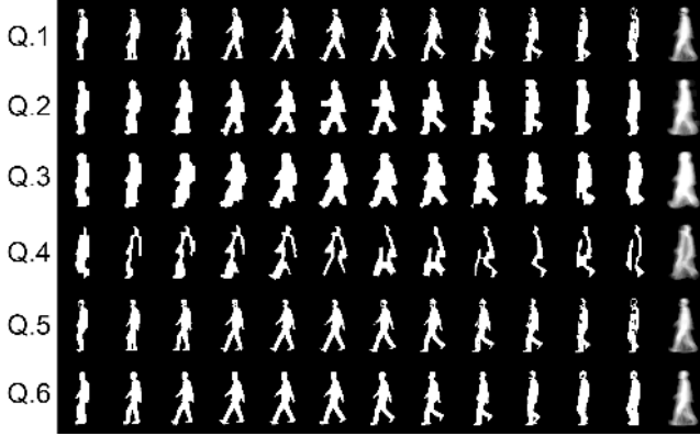
Figure 2: Sample gait silhouette binary images and their corresponding GEIs (right -most column) computed at six different qualities for the same subject.

are listed in Table 1. The segmentation approaches are explained in the following paragraphs.