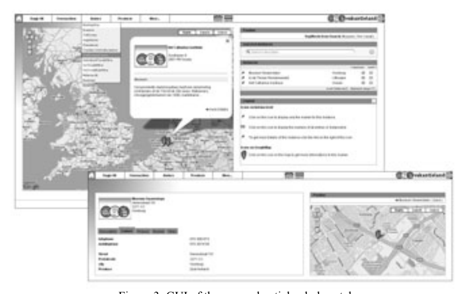
Figure 3: GUI of the new vakantieland.nl portal

The structure of the application, which is implemented in the script language PHP<sup>7</sup> follows a well known architectural pattern called MVC<sup>8</sup> [Bu98]. The model component abstracts the accesses by the controller on the Powl-API, which in this case also manages the extraction of data from the TripletStore to make the data suitable for the requirements. The RAP<sup>9</sup>-API [OB04] which is used by the Powl-Api allows to query the model with SPARQL [Be06]. SPARQL was used to identify and find resources with specified characteristics in an efficient manner. After the identification of the resource URI, an object with all the existing information is created with the Powl-API. Such generated objects will be requested by the appropriate controller and assigned to the view component. The view component produce the output with the help of templates.