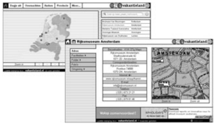
Figure 1: GUI of the previous version of the vakantiland.nl portal

The previous version of vakantieland.nl displayed tourism destinations (e.g. destinations and information points in cities), which are called "Point of Interest" ("POI"). Every POI was associated with at least one category and could be viewed either by selection of the category or through other relations, it had, to other POIs. The output of POIs were in the form of lists and points on maps. The maps, where those points were displayed upon, were saved as images in different zoom steps. Then the tourism destinations where positioned on the maps with the help of their coordinates. For every POI information like name, contact addresses, opening hours and pictures was provided and could be viewed in detail next to the map as can be seen in Figure 1. Additionally a map of the area showed a list of close-by POIs. These associations served as a further mean of navigation between POIs.