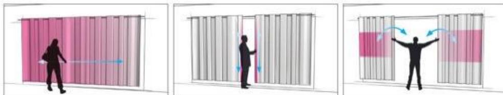
Figure 1: Possible ways of interacting with an augmented curtain. The gestures on the left and on the right are taken from traditional curtains, whereas the middle one relates more to vertical persian blinds. In this paper, we built on the interaction on the right.

The interaction is designed similarly to how you would draw a curtain open in the morning, with a large swipe from the center to the outside (see Figure 1). As motorized curtains are usually installed on large windows, the user cannot cover the entire surface of the curtain with one gesture. Furthermore, it should be possible to open the curtain at different granularities. We designed a sensing pattern that allows both coarse and fine input.