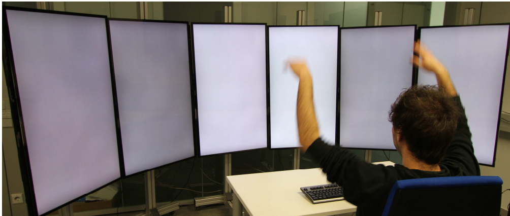
Figure 2: A participant is performing a gesture.

Inspired by Wobbrock (Wobbrock et al. 2009), we conducted a user study to design a gesture set for manipulating application windows. We recruited 10 male and 2 female participants through our mailing lists. In the study, we ask them to perform gestures for a given command set (see Fig. 1). We repeated this for every command and participant three times. For analyzing the performed gestures, we recorded all sessions on video. Through the analysis of the user study, we were able to generate a set of gestures to perform the 14 most common window management tasks e.g. select window, move window or resize. In a second step, we implemented the gesture set as fully working application for Windows 8.1.