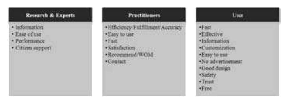
Figure 1: Selected quality domains

The transaltion of these domains into a practical evaluation tool can be read in Table 1.