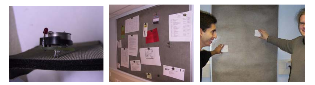
Figure 1: An implementation of the Pin&Play concept. From left to right: the networked surface and a pin-attached iButton computer; a smart noticeboard with more than twenty networked objects; and a demonstrator illustrating flexible placement of networked light switches on the wall.

Pin&Play is a different kind of interactive surface. It does not replace the physical objects that we commonly find on walls with virtual ones but instead promotes these as interactive objects that are networked through the surface. The principal idea is that the surface supports attached objects not only as a physical structure but also as a communication medium (Van Laerhoven et al. 2003). In this concept, physical attachment and digital attachment become one – enabled by the use of pushpins as physical connectors that are familiar (with a strong physical affordance) and flexible (providing socket-less connection). The result is a system that can transform walls into interactive networks of smart objects – with a potential to support the entire spectrum of everyday interactions, form the attachment of light switches to collaborative brainstorming.