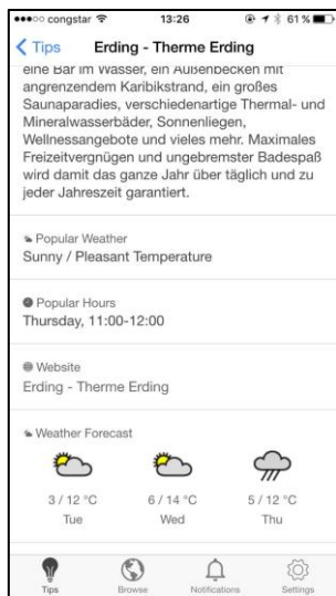
Figure 4: POI Popularity Forecast

In the POI detail page (Figure 3), we integrated a weather forecast for possible visit times of users to show their current or future weather context (Figure 4). A map shows both the user's and the POI's location and the distance. The popularity of a POI in different contexts is essential to our concept and displayed in two different ways: First, we show a textual summary of the popularity peak for both weather and day/time (Figure 4). Second, we render line and bar charts to show the popularity across different context dimensions, such as day of the week (Figure 5), time of day or season (Figure 6).