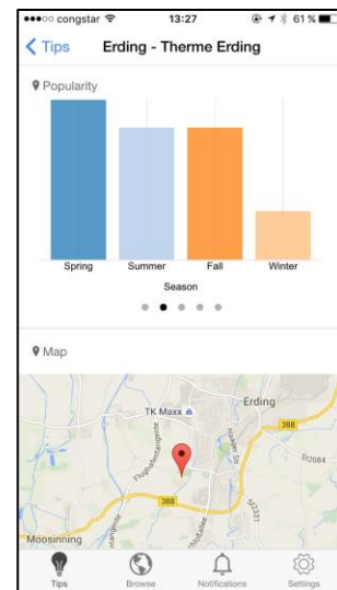
Figure 6: POI Popularity Graph