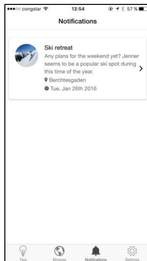
Figure 2: Notification