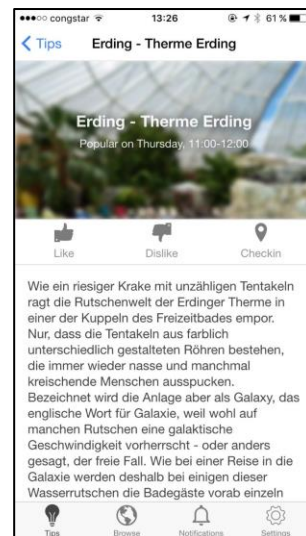
Figure 3: POI Description