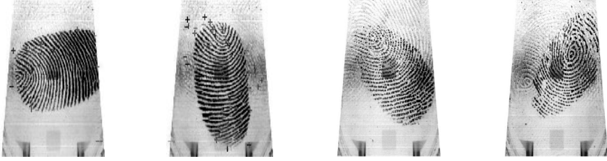
Fig. 2: Images with “stable” minutiae (first two images from the left) and ghost fingerprints.

to a visual analysis it could be confirmed that there is FP information of the same finger from a previous acquisition present in most of the cases (see Figure 2 as example). In the presented images minutiae in the ROI are coloured red and blue if they belong to the background. If a minutia is marked as stable it is coloured green (ROI) or magenta (background).