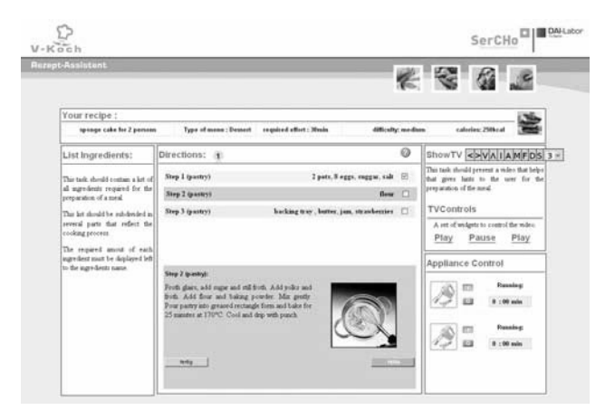
Figure 2: Example of the virtual cook user interface loaded into the runtime environment.

Our runtime system loads the complete task tree including all annotations into our task tree interpreter. The interpreter then identifies the initial ETS and utilizes our include mechanism to assemble the final user interface (see figure 2). In difference to already existing approaches like [Mo06][Pa02] we do not distinguish between a tool and the final runtime environment of the application. Each modification directly effects the resulting application. This WYSIWYG approach allows all involved parties (user interface designers, user interface developers, usability experts and service developers) to work simultaneously as soon as a first sketch of a task tree has been realized. Each developer can work independently according to the process we have described, but the centralized web-based development tool allows the coordination of the different work packages and promotes the exchange of feedback, based on a commonly understood and available prototype. Every person involved in the user development process can instantly check the effects of any modification on the whole application. This system features an integrated development process as well as the delivery of user interfaces based on a task model.