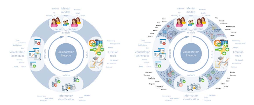
Figure 2: Integration of different functions to activity streams