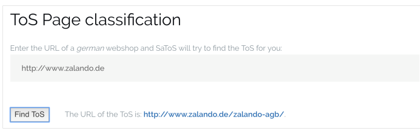
Fig. 2: Input mask of the consumer prototype

In the consumer prototype, the URL of a web shop can be entered through an input field. After clicking on the "Find ToS" button (cf. Figure 2), the backend classifies all outgoing links of the input page with the classifier described in Section 5.1. A breadth-first search is conducted until a ToS page was identified. As an intermediate result, the URL of the ToS page is shown next to the button.