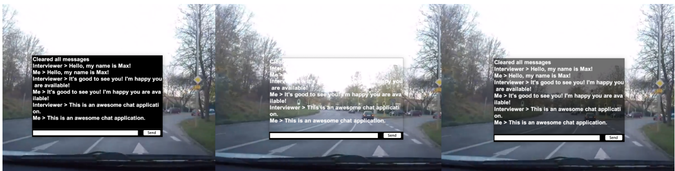
Figure 1: Chat application on a windshield display with variants of background transparency: fully opaque, fully transparent, luminance-adaptive (left to right).

Clemens Holzmann University of Applied Sciences Upper Austria Hagenberg, Austria clemens.holzmann@fh-hagenberg.at