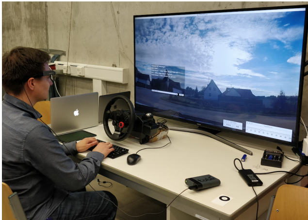
Figure 2: The study setting.