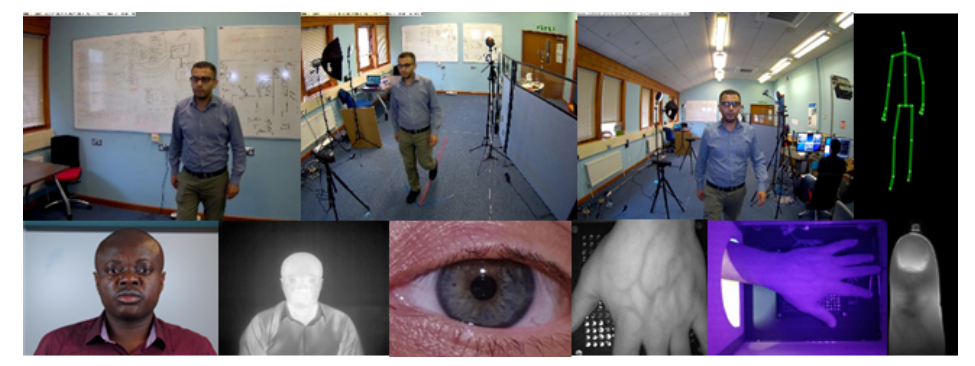
Fig. 1: Samples from the PROTECT Multimodal DB database: 2D face, anthropometrics, 3D face, thermal face, iris, hand veins, finger veins.

traits, when compared to previous databases with 6 (Biosecure-BMDB; MBioID; JMBDC; and BIOMET); 7 (MyIdea); and 8 (BiosecurID) different traits.