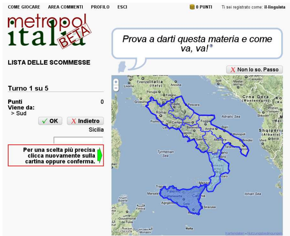
Figure 2: Borsa Parole during the choice of an area for the displayed sentence: The sentence displayed on top means “Try to take this exam, whatever may happen!” The user is in round (“Turno”) 1 of 5 and has so far achieved 0 points (“Punti”). “Viene da” means “Comes from”, “Sud” means “South” (the area currently selected and marked with blue borders), the two left buttons are called “OK” and “Back”, the request in the red box on the left hand side means “For a more precise choice click on the map again, or confirm.” The button above the map is called “I don’t know. Skip”.