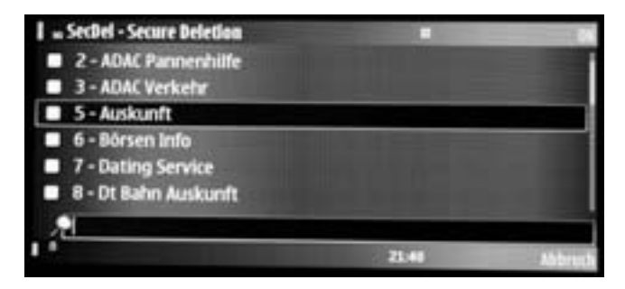
Figure 3: SecDel select contacts which should be deleted

After such a list element has been created from each of the telephone book entries, it is saved in a list. Then a Multi-Selection-Listbox is created with the help of this list. This listbox (see Figure 3) enables the search for entries and marking of several entries in order to delete all these entries at once.