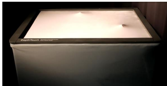
Figure 1: The proposed interactive deformable surface.

In this article the idea of music composing with an elastic tabletop including tangible objects embedded into its surface is described. An elastic display dynamically creates several physical shapes representing different music samples for interaction. The shapes can be activated and manipulated by the user to arrange the associated samples. The key benefits of this form of interaction are the intuitive use, the ability to playfully explore music and the expressiveness of the physical representation of sound.