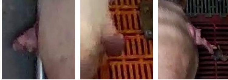
Fig. 2: Example of birth definitions