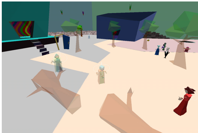
Figure 2: live avatars watch a ghostly 3D flashback