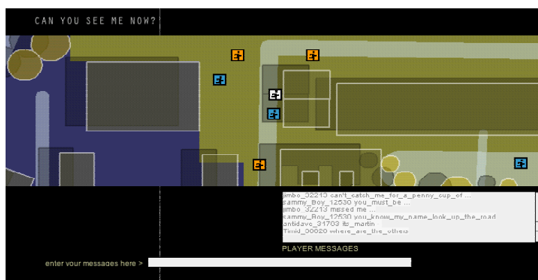
Figure 4: An on-line player's Interface

Figure 4 shows an example of the player interface. A simple white icon showed the player's current position according to their local client. Other players were represented as blue icons. The runners were shown as orange icons.