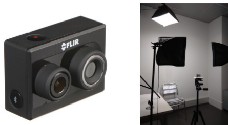
Fig. 1: Flir Duo R camera and the acquisition setup.

The presented database was acquired with a newly developed dual sensor, visible and thermal, camera FLIR Duo R by FLIR Systems [FI]. This camera is designed for unmanned aerial vehicle allowing to capture simultaneously images and videos in both visible and thermal spectra. Accordingly, it is well suited for our database collection aimed at fusion for face recognition as well as cross-spectrum applications. The visible sensor is a CCD sensor with a pixel resolution of 1920 \times 1080 . The thermal sensor of this camera is an uncooled VoX microbolometer and has a spectral response range of 7.5 - 13.5 \mu\text{m} with a pixel resolution of 160 \times 120 . Even though the thermal resolution of the camera may seem low, Mostafa et al. [Mo13] demonstrated that high face recognition rates can be achieved even with low resolution 64 \times 64 pixels thermal face images.