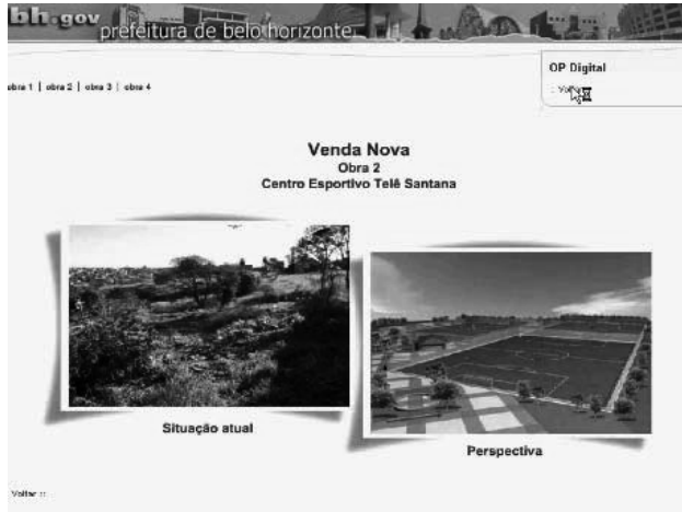
Figure 2: Pictures of the construction works in Digital PB

The video and streaming (DMP) resources available in the Digital PB allow a good level of interactivity, since they synchronize voice, image, and text resources in a single application, providing a complete and dynamic overview of the construction work, besides providing accessibility to people with special needs. Streaming is a technology that permits watching the video while it is still downloading.