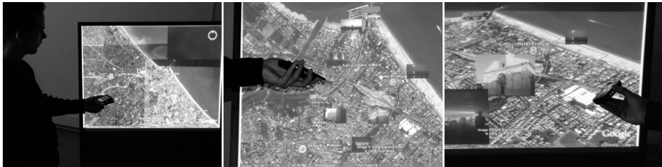
Figure 4: Remotely operating Google Earth with a mobile phone | zooming in | tilting the surface.

Google Earth COM API. With it, one can remotely operate the Google Earth interface and perform the interactions depicted in Figure 4: Panning of the map is simply performed by a continuous tilt interaction of the handheld device in the corresponding direction. To facilitate the various interaction modes provided with 3D map programs, mode switches are required. Pressing the central button on the phone, users can switch between pan mode and zoom and tilt mode . In the latter, zooming in is performed in a continuous way by moving down the phone (see Figure 4, center), zooming out by tilting it in the opposite direction. Changing bird's eye view to street view, i.e. tilting the map, is achieved by tilting the phone to the left or right, which becomes more natural when rotating the phone about 90^\circ to a position as shown in Figure 4 on the right.