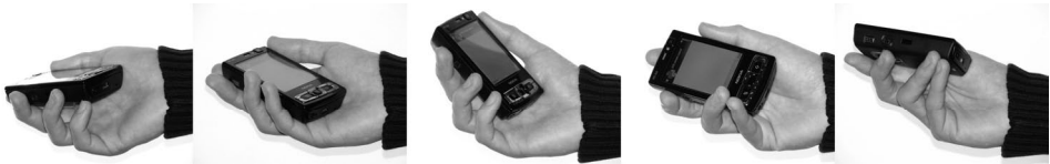
Figure 1: Tilting along the x axis: down , neutral , up and along the y axis: left , right .

We identify the following basic set of interactions: up , down , left , and right movements of either a cursor position, some widget highlight (such as in menus), or a direct mapping to navigate a movable application space (e.g. maps). These four movements can either be discrete (stepwise) or continuous (fluent) . For the latter we distinguish between a linear and non-linear mapping of the movement to the resulting interface changes.