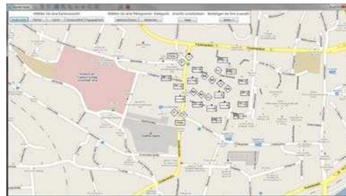
Figure 2: Example Option digital road map and tactical symbols