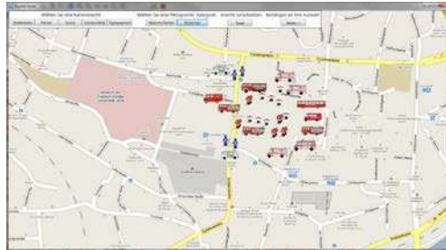
Figure 1: Example Option digital road map and map symbols

the position of rescue forces of fire brigades, police and emergency medical services and certain operational vehicles.