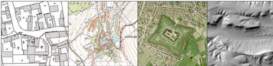
Figure 4: Cadastral map, topographic map, orthographic map, terrain model