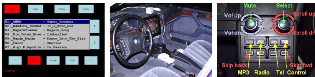
Figure 1 (from left to right): Standard interface, working environment and layout of the key-console

For exchanging information between the individual modules of the system we have developed a special communication architecture based on an extended context-free grammar formalism. As the grammar completely describes the interaction vocabulary of the application, it facilitates the representation of both domain- and device independent multimodal information contents. Thus, natural speech utterances, hand gestures, and specific tactile interactions can be described via the same formalism. The terminal symbols of the grammar represent the smallest significant semantic units of potential user interactions. In a client-server approach, multimodal information units are exchanged in the form of indexed string messages over TCP/IP sockets (McGlaun, 2002a).