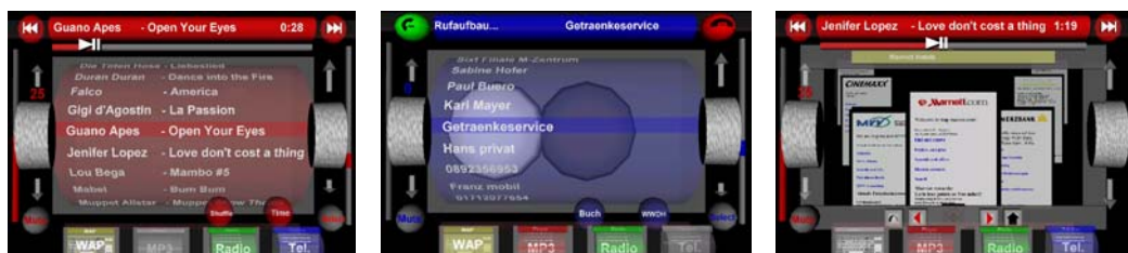
Figure 2 (from left to right): Design of the MP3-mode, the telephone mode and the WAP mode of the VRI

The status bar in the upper area of the interface serves for informing the user of the currently active application and, additionally, provides the basic interaction functionality in a very compact form. In MP3 and radio mode, this holds for skipping, in the case of the telephone mode it stands for accepting and denying a call. The status bar facilitates a mode spanning operation of the other devices without the need to really change the modes. This feature is extremely helpful since it provides an elegant possibility to adapt the interface to personal needs, e.g. the MP3 device can still be operated while the user is searching a specific name in the list of telephone book entries.