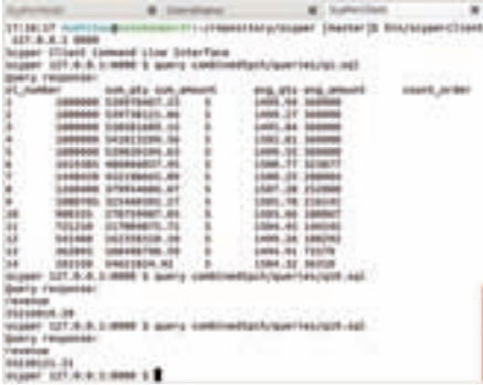
Figure 2: ScyPer CLI Client