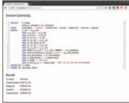
Figure 3: ScyPer Web Client