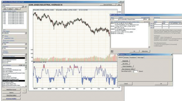
Figure 1: Main window of TinTo

Readings above +100 imply an overbought condition, while readings below -100 imply an oversold situation. When the CCI moves above -100, this is interpreted as the beginning of a positive price trend and, thus, may serve as a buy signal. The position should be closed when the CCI reaches +100 as it enters an overbought condition. CCI values can be analogously used as short selling signals.