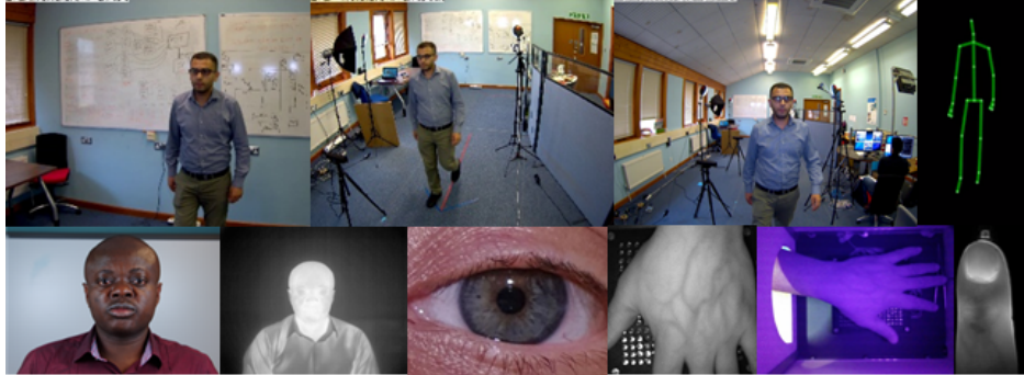
Fig. 1: Samples from the PROTECT Multimodal DB database: 2D face, anthropometrics, 3D face, thermal face, iris, hand veins, finger veins.

traits, when compared to previous databases with 6 (Biosecure-BMDB; MBioID; JMBDC; and BIOMET); 7 (MyIdea); and 8 (BiosecuID) different traits.