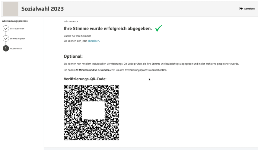
Fig. 3: The successful transmission of the vote is signaled and the user is given permission to sign out. The optional possibility to verify one’ vote by scanning the QR code with the “SozialwahlVerifier” app is presented.

Subsequent to the vote submission, the participant was greeted with a confirmation message, signifying the completion of the voting process. This message informed the voter that it was now safe to exit the page. Additionally, a QR code was displayed on the same page, intended for verifying the submitted vote using the “SozialwahlVerifier” app (see Fig. 3).