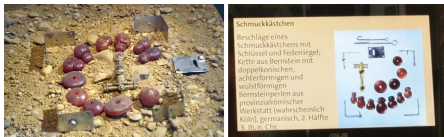
Figure 4: An artefact (jewelry box) with corresponding information on screen.

Different from most Kinect-based projects in the literature that interact with screens and wall displays (e.g. Brown et al. 2014, Pietroni & Adami 2014, Schieck & Moutinho 2012), angular error is an issue for pointing along a horizontal plane, and increases with rising distance of the target. Small postural variations have increasing effect on accuracy with distance. Fortunately, tests revealed that user size had little influence, as long as users were > 1,50m. For shorter users, the angle is too flat. Based on the current implementation, a minimal hot spot radius of 100mm was chosen as threshold for set-up, and achievable pointing accuracy in authoring mode determines the hot spot size. A complex issue was dealing with eye-hand visibility mismatch (Mine 1995, Argelaguet et al. 2008), that is whether the user imagines the 'pointing' vector as going from elbow to finger or as 'aiming' from eye to finger. We thus calculate both pointing and aiming vector, resulting in a larger combined target area. While people seem to have a preference for either pointing or aiming, the IMI cannot exploit this, since there is no opportunity and time to personalize the system for a given visitors. In general, studies found large individual differences in how people point - there is thus no ideal general algorithm (Brown et al. 2014).