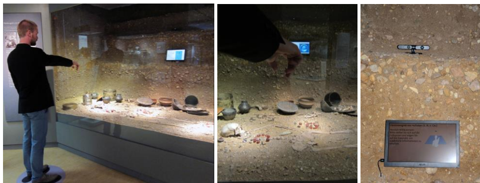
Figure 1: (left, middle): The IMI inside the showcase of the grave of a Germanic princess. Who stands on the footprints can select artefacts by pointing. (right): Output screen and tracking sensor are embedded in the back wall.

Our IMI system (figure 1) enables interaction at a distance via pointing. Pointing is the main (and sole) interaction mode not only for visitors, but also for setup and configuration. Users point at artefacts in the showcase and are shown information on a screen. The system provides guidance on how to interact and select items. It is easy to maintain and enables curators to set up a new exhibit, thus reducing reliance on technical staff or companies, important in this context, as limited museum budgets often hinder technical innovation (Maye et al 2014).