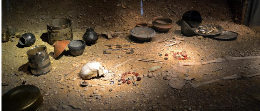
Figure 2: View of the burial site from an adult height viewpoint.

An initial study at the start of our project aimed to find out how visitors currently attend to the Haßleben exhibit. Over 5 full days, we informally observed visitors and interviewed them after they exited the room, to see whether they had noticed the showcase and what they remembered. Overall 19 groups of visitors were observed and we could interview 14 of these (visitor numbers on this level are low). Many groups just looked for 10 seconds, and just about a third (six) spent 1-2 minutes; thus on average, groups spent less than a minute. Most visitors engaged closer by inspecting details, but only five groups looked at the text panel located left of the showcase. With the 14 interviewed groups, memory of the contents was sketchy. Only two groups remembered the fibula and hair-pin artefacts, and only two knew the grave contained an ornate wooden jewellery box of which only the fixings had remained (figure 4). Our observations confirmed curators' impression that visitors do not realize the grave's significance, and supported their wish to attract more attention to the showcase and encourage visitors to learn about the artefacts. Moreover, visitor groups were frequently seen to be pointing at the showcase and its contents when talking about these. This motivated us to pursue a pointing-based interaction design for the IMI.