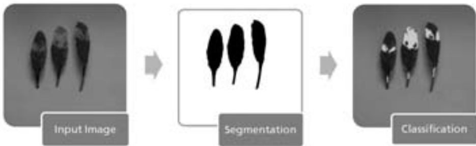
Figure 2: Workflow: First the input image is segmented into foreground (black) and background (white). Then for each foreground pixel a classification is performed. Unhealthy classified pixels are marked cyan.

The workflow of the proposed algorithm is visualized in Figure 2.