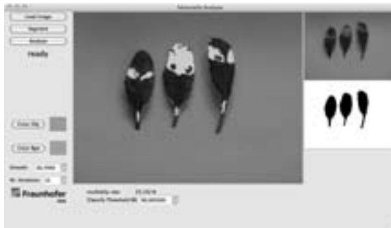
Figure 3: Screenshot of the algorithm GUI. In the center the marked pixels are displayed. On the right the input image and the segmentation result can be seen. On the left and at the bottom control parameters can be set.

In this section, we present some experimental results achieved with the proposed algorithm. In Figure 3, one can see a screenshot of the graphical user interface (GUI) developed for this task. The big benefit of this GUI is its simplicity and clarity. Users without knowledge about the underlying algorithms can use them efficiently to classify. Additionally, one can see some classification and segmentation results for a given input image. Some further results are displayed in Figure 4. As it can be easily recognized, the automatic classification results match the visual perception of a human observer. These examples make clear that the proposed algorithm shows reliable results. Unfortunately, we did not have a ground truth for this data to intensively analyze the algorithm, but we can say with fair certainty that this work is a good basis for further development.