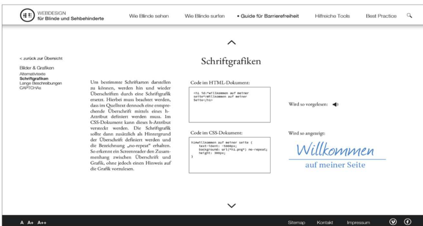
Figure 2: Showing code examples for download